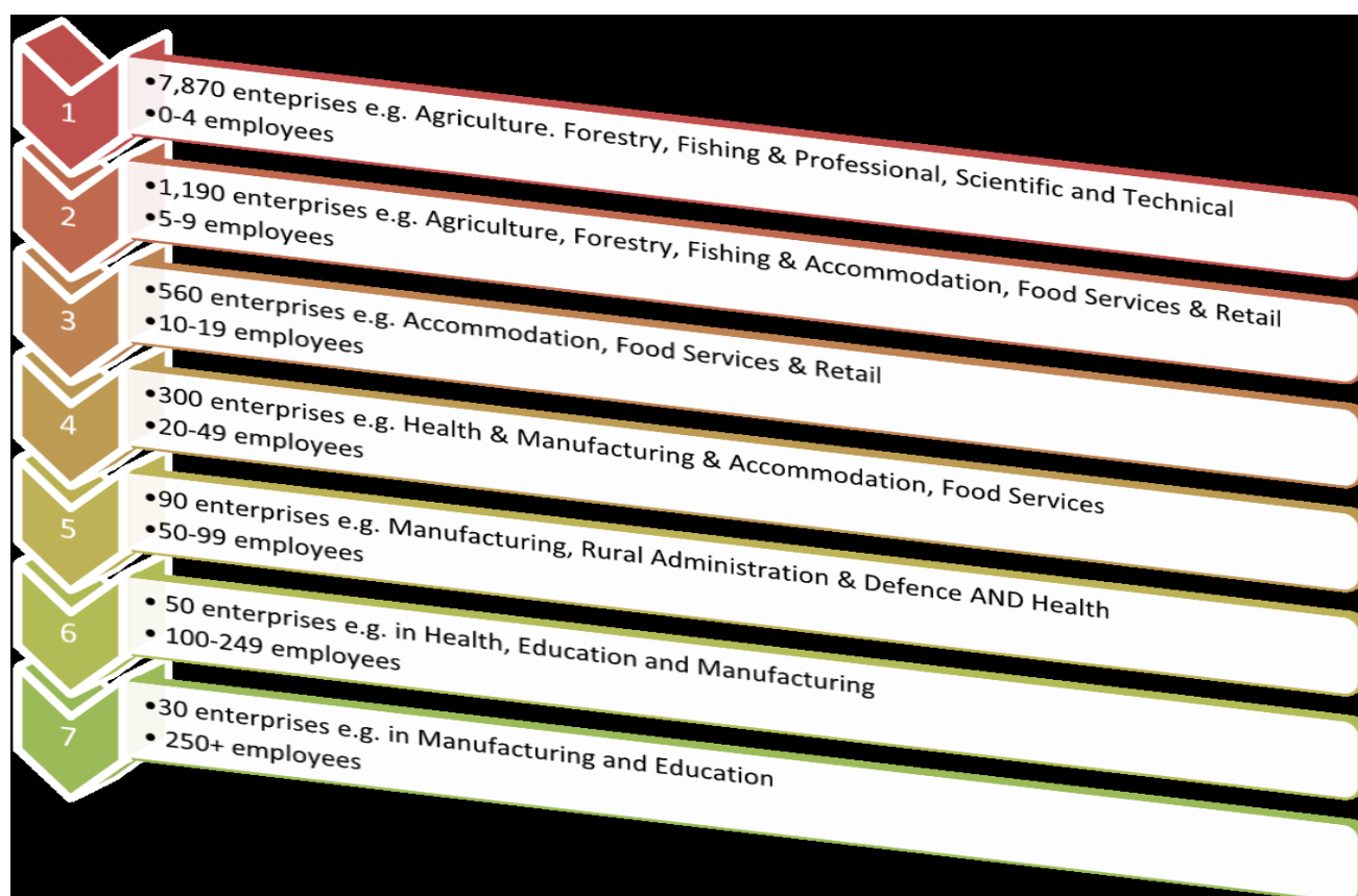
Fig 1 Business in Herefordshire by size, type and employee numbers